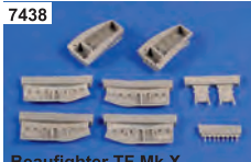
Beaufighter TF Mk.X Main Undercarriage Bays Correction