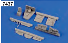
Beaufighter TF Mk.X Cockpit