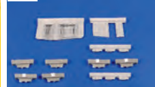
Beaufighter Mk.X Armament - Wing Gun Bays